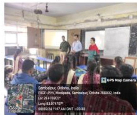
Aparna Motors, Sundergarh