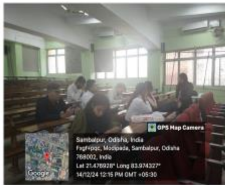
Infinity Hyundai, Jharsuguda