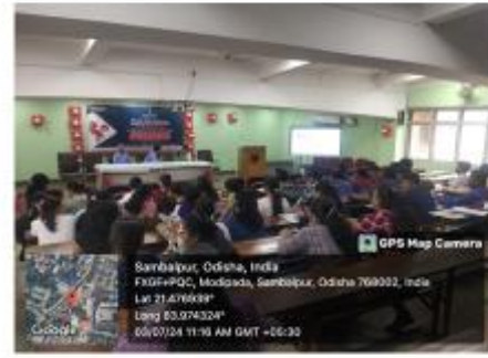
ICICI Bank, Sambalpur