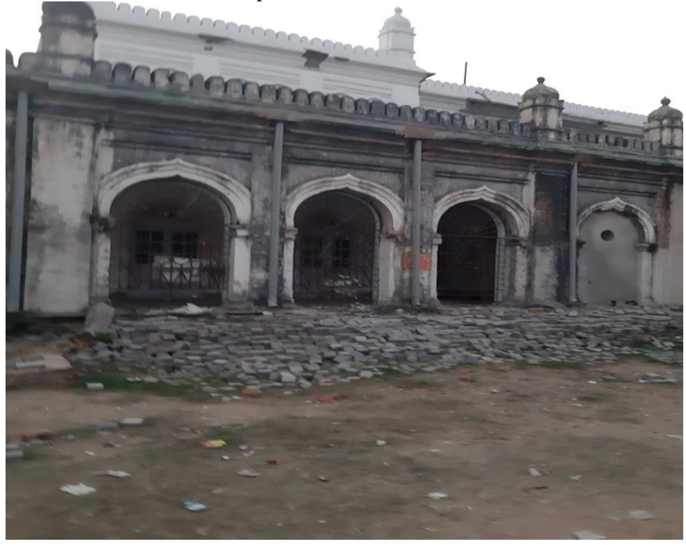
View of the Victoria Hall