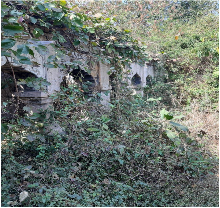
Ruined Structure of Raja bakhri