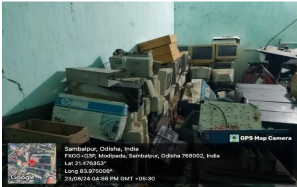
Storage room for E-waste